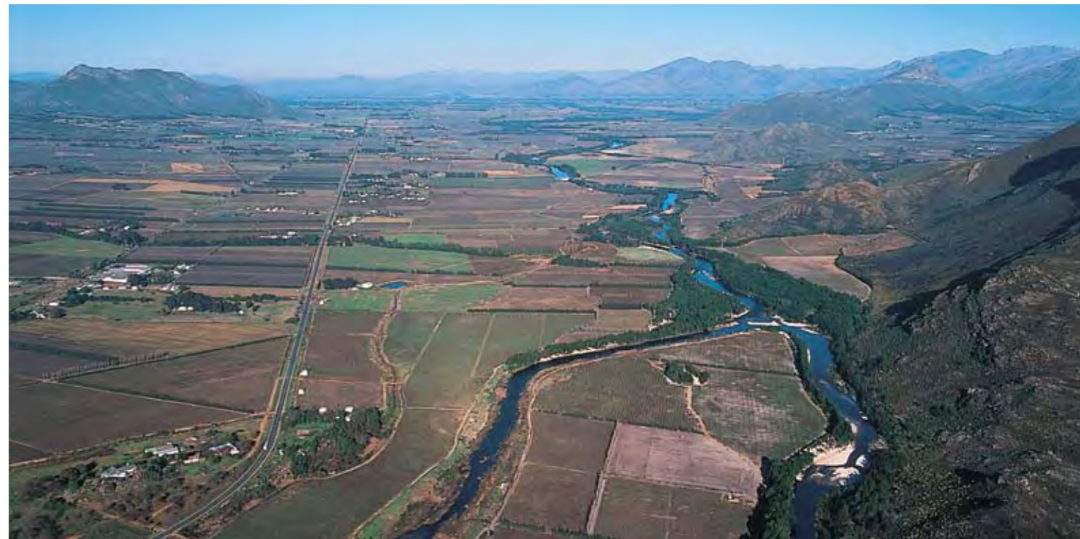
The Breede River Valley is intensively farmed, and features a mosaic of vineyards and fruit orchards, and a riparian strip dominated by alien eucalypts and wattles.

For weeks on end he pursued plenty of fishing, soaring and calling eagles, and was roped into more wild fish eagle chases than he cares to remember in search of 'nests' that farmers were 'sure' had been