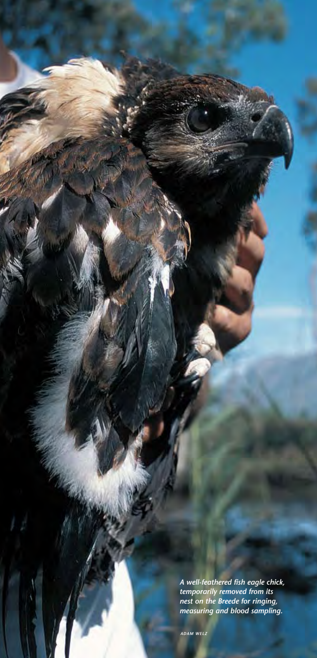
A well-feathered fish eagle chick, temporarily removed from its nest on the Breede for ringing, measuring and blood sampling.