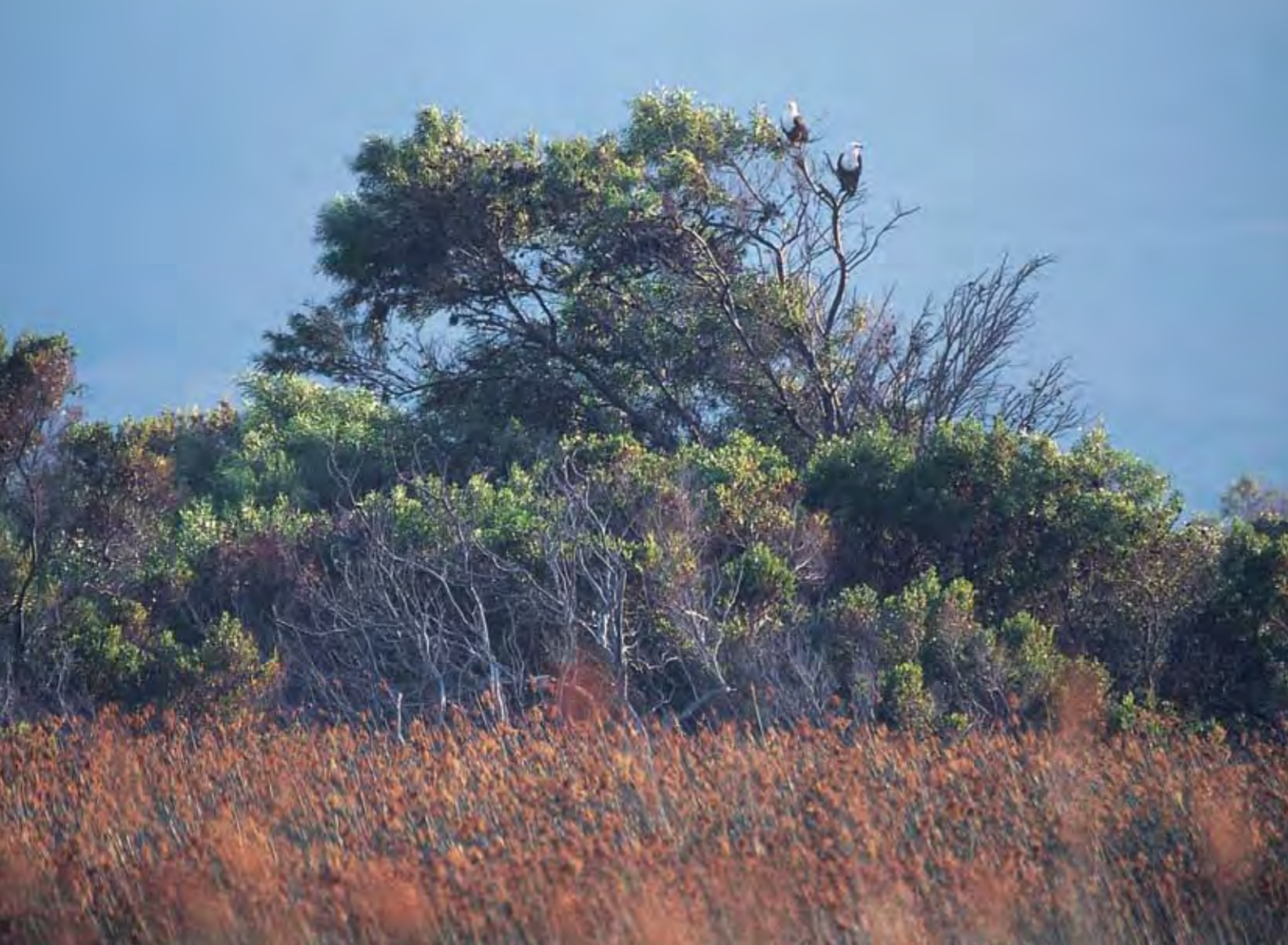
A pair of African Fish Eagles perch together in the Breede River floodplain.

Much of the knowledge about this species has come from research carried out in East Africa – very little work has been done in the south-western parts of its range, and we had no clear idea of what might potentially endanger its survival in the Breede River Valley. In fact, we didn't even know how many fish eagle pairs might be in the region.